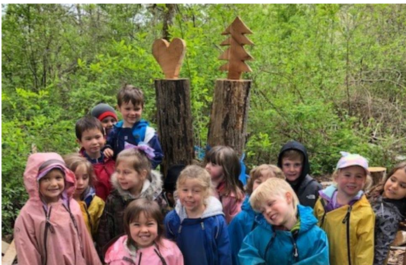
The kids in the Kiddie Capers program at Commonwealth were surprised to come back to the Friendly Forest after an adventure to find these fun carvings left behind by the Saanich Arborists!