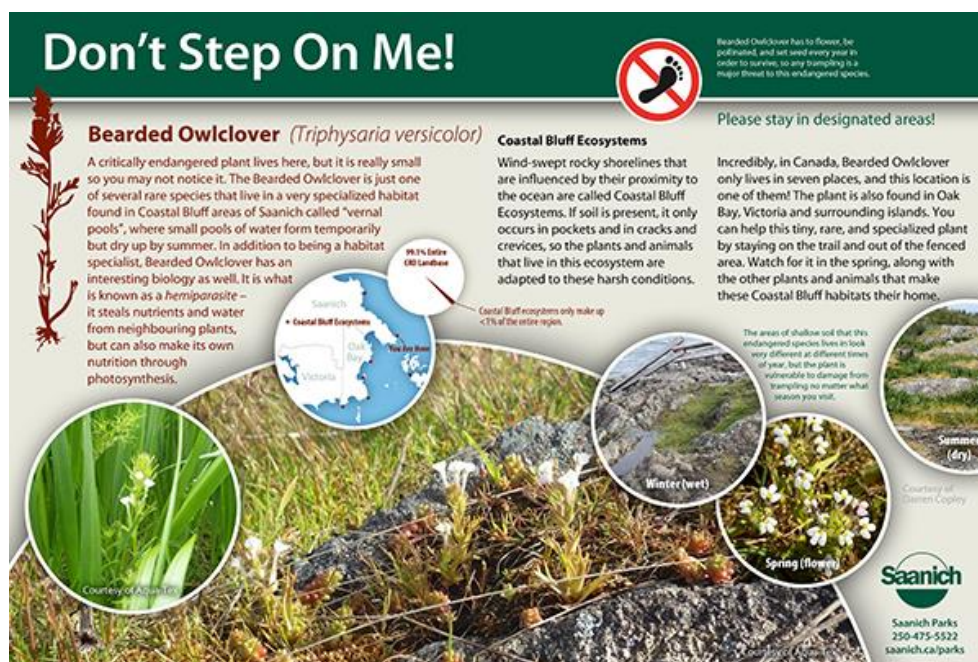
Bearded Owlclover sign - Draft 2

Parks and Environmental Services staff have been working together to prepare a sign about the endangered Bearded Owlclover plant. Once finalized this sign will be placed at the Baynes Road Beach Access at 10 Mile Point. This 12” x 18” sign template was designed so that it can be utilized for other signs in the future – featuring other rare and endangered species.